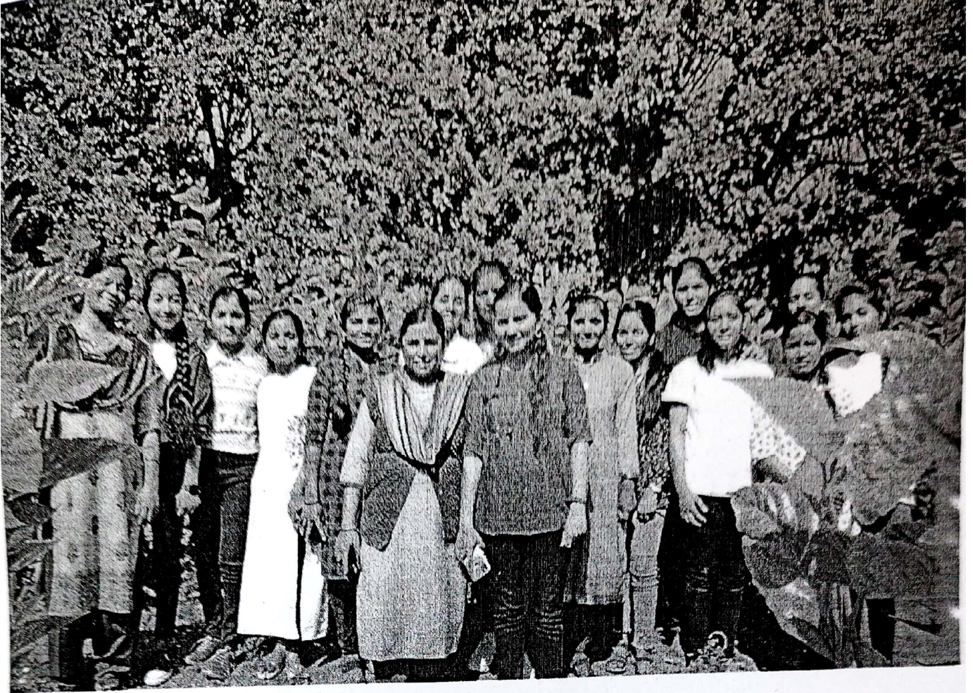
Students at Mulberry Field, Wai