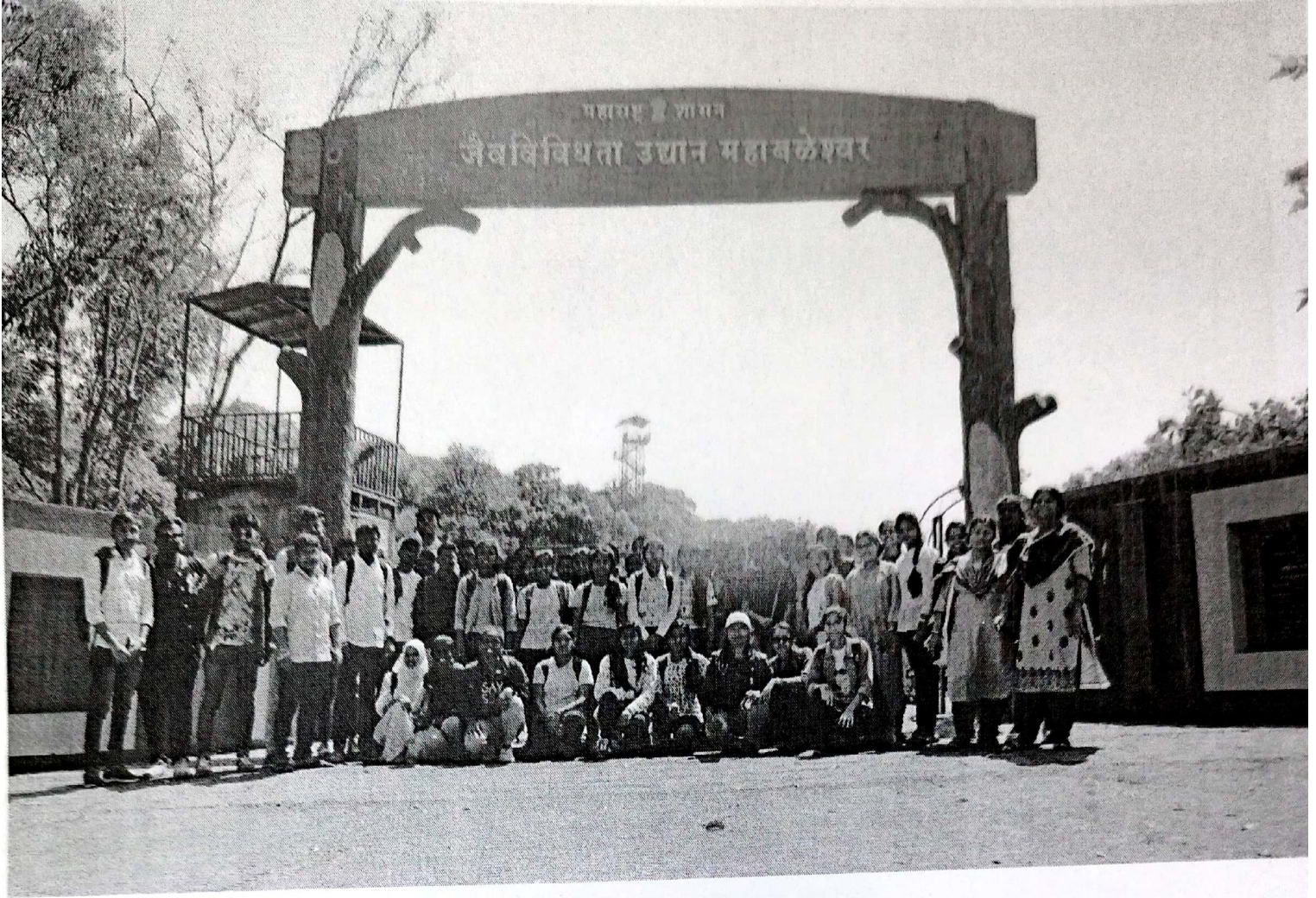
Students at Biodiversity park, Mahableshwar