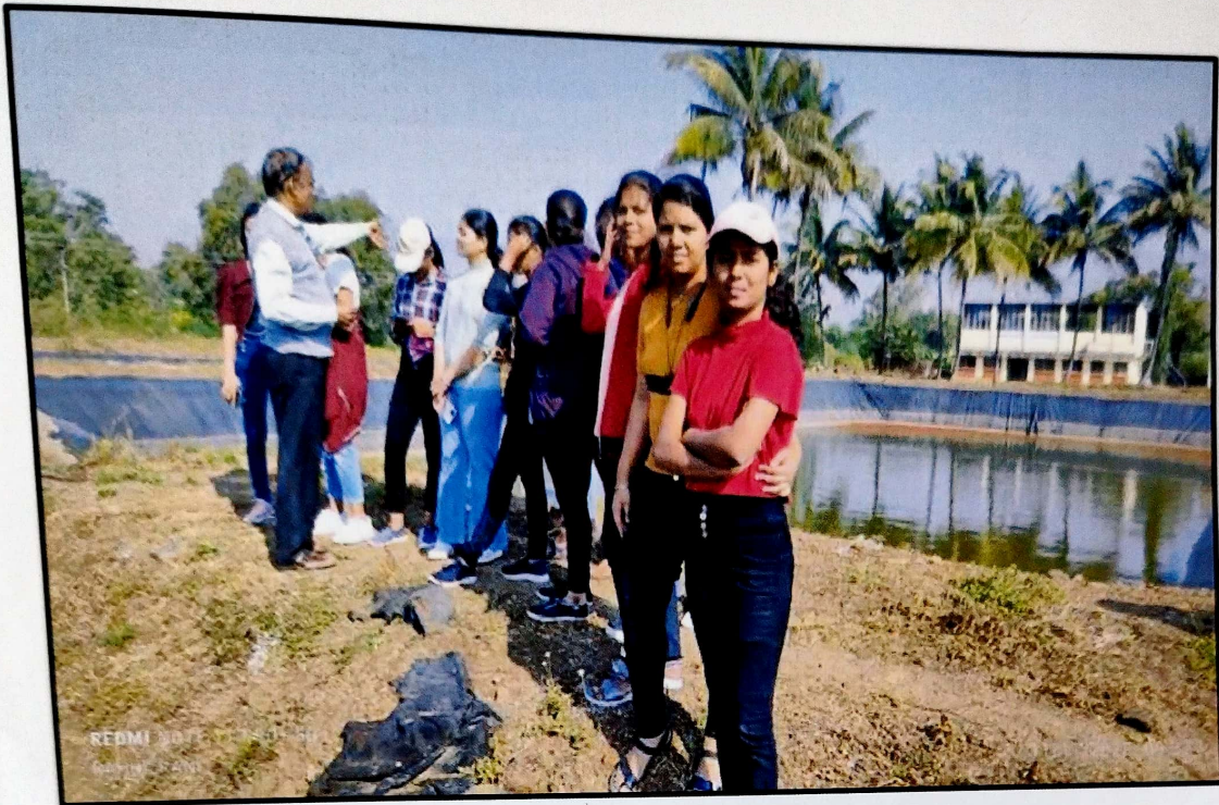
Visit at Apiculture industry – Madhuban at Mahabaleshwar