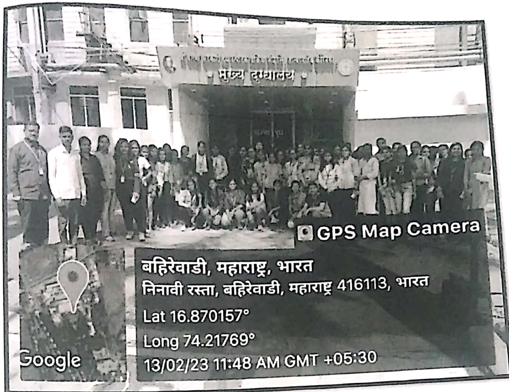
Industrial visit at Shri. Warana Sahakari Dudh Utpadak Prakriya Sangh Ltd., Warnanagar