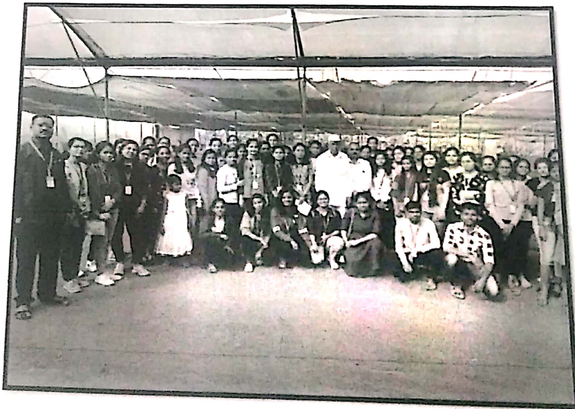
Green House - Seema Biotech, Talsande