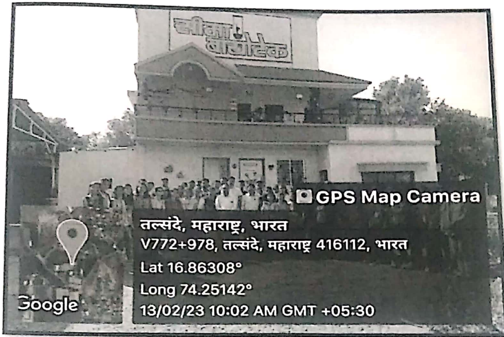
Industrial visit at Seema Biotech, Talsande