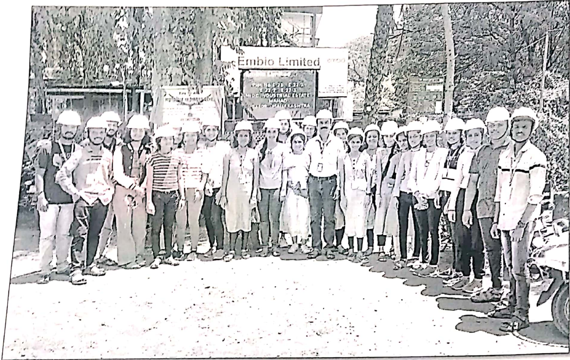
Photo: Visit to Embio Biopharmaceuticals Ltd. Mahad